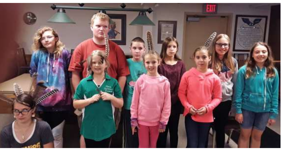
2019 Junior Archery Development Banquet